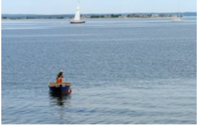
Photo Gallery - McDonough Lunch Converse Garden &