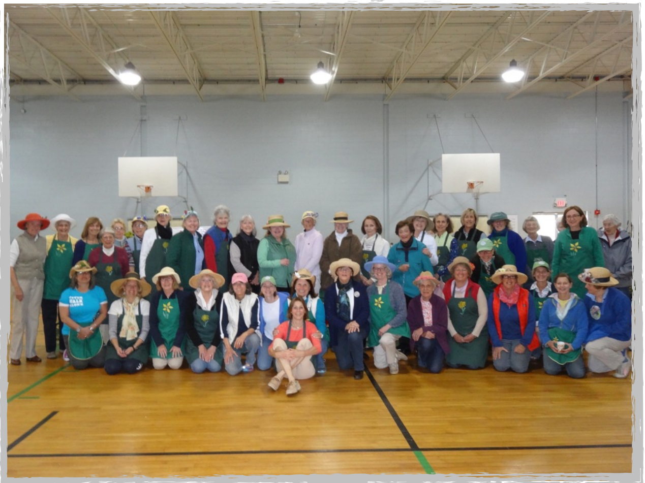
Photo missed the Summer 2015 Newsletter, but here we all are now for posterity.