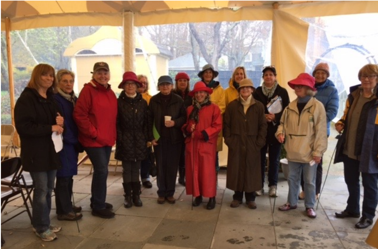
Braving the weather at 2016 Backyard Botany