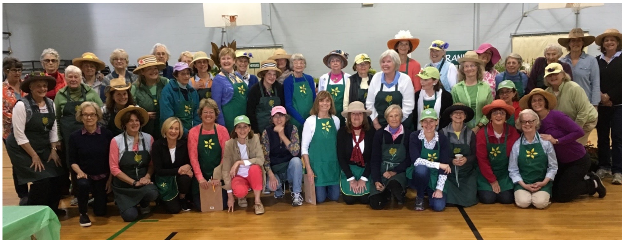
GCBB members at 2016 Plant Sale