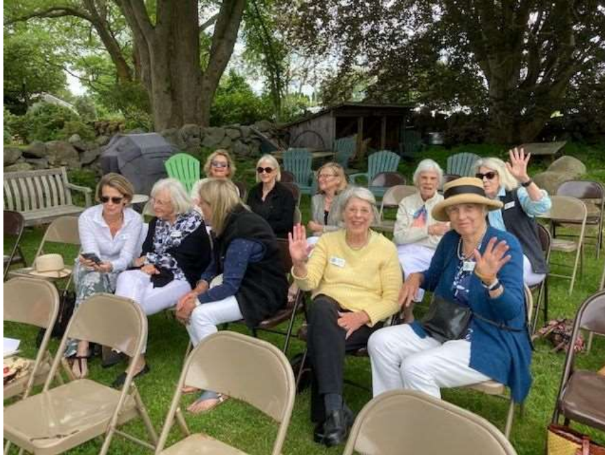
A small sampling of happy GCBB members. So happy to be together!