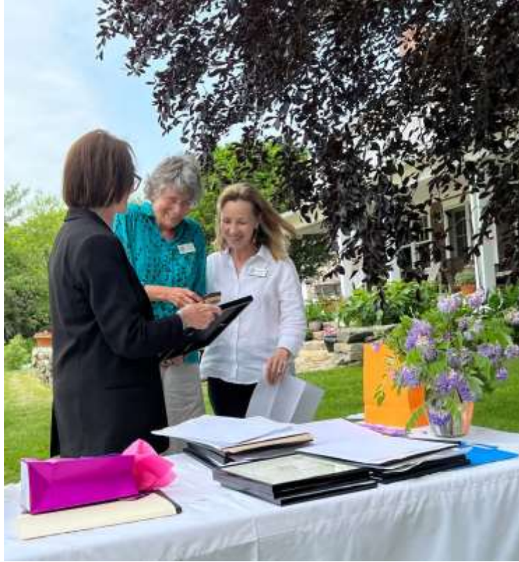
The joy of an award so well deserved!