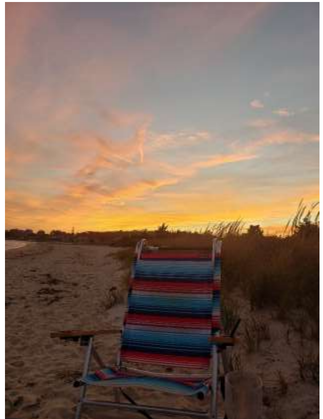
Savoring every minute of an unexpected beach day on Sunday, November 6, 2022.