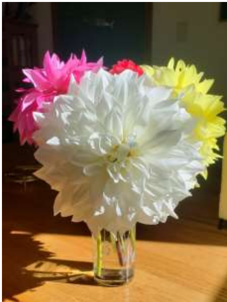
Afternoon sun on the last of the season's dahlias.