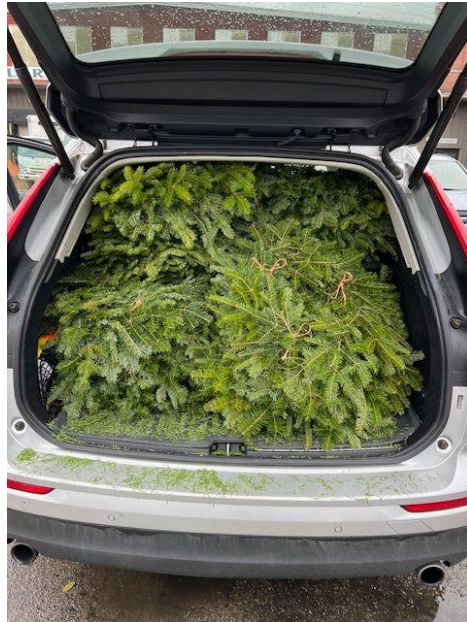
Wreaths ready for decorating!