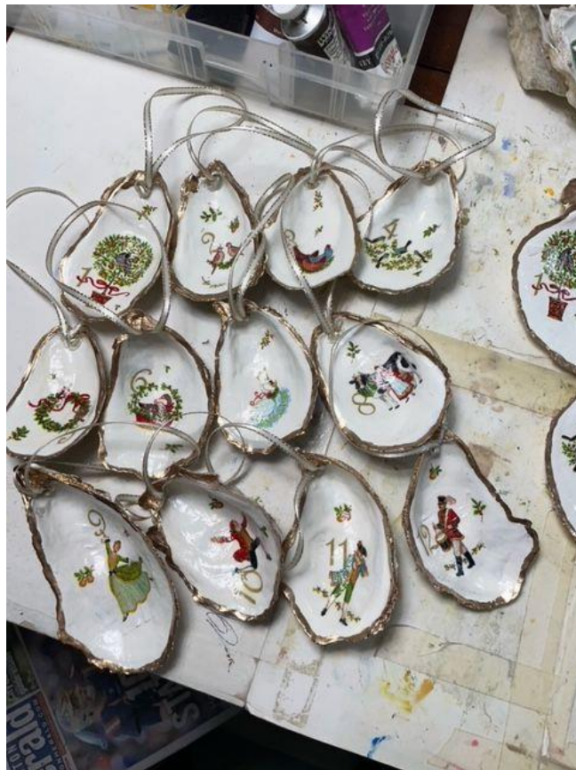
Twelve Days of Christmas ornaments