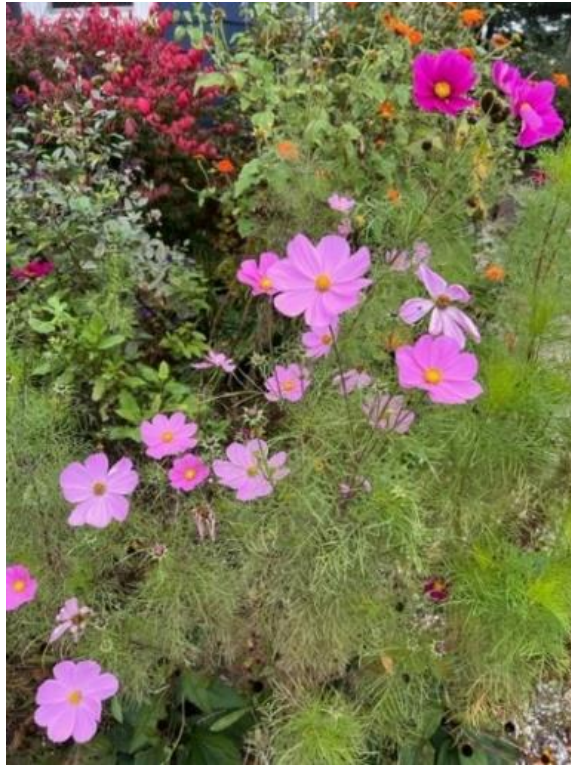
The last of the Fall flowers at Sue Daylor's