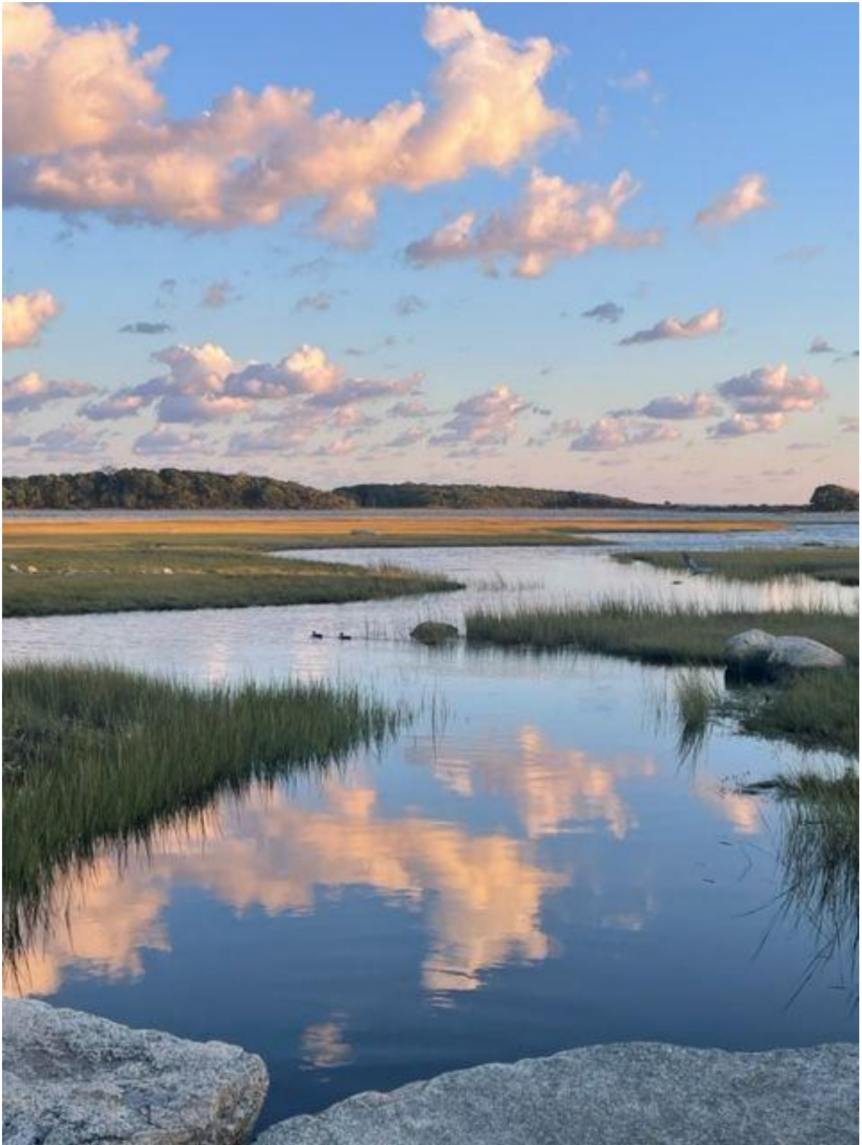
Iryna Priester shares the view of Mattapoissett entering Point Connett.