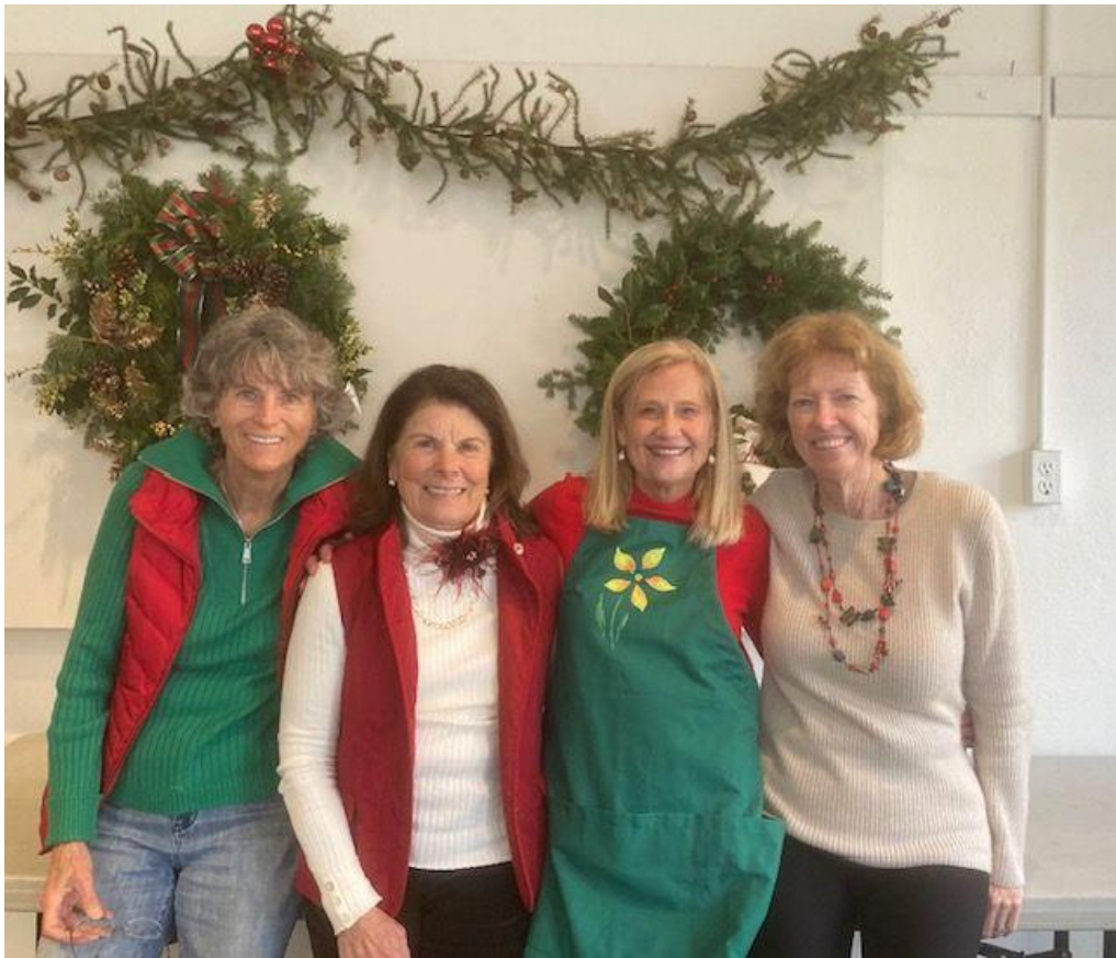
Our amazing Holiday Greens Market Team!