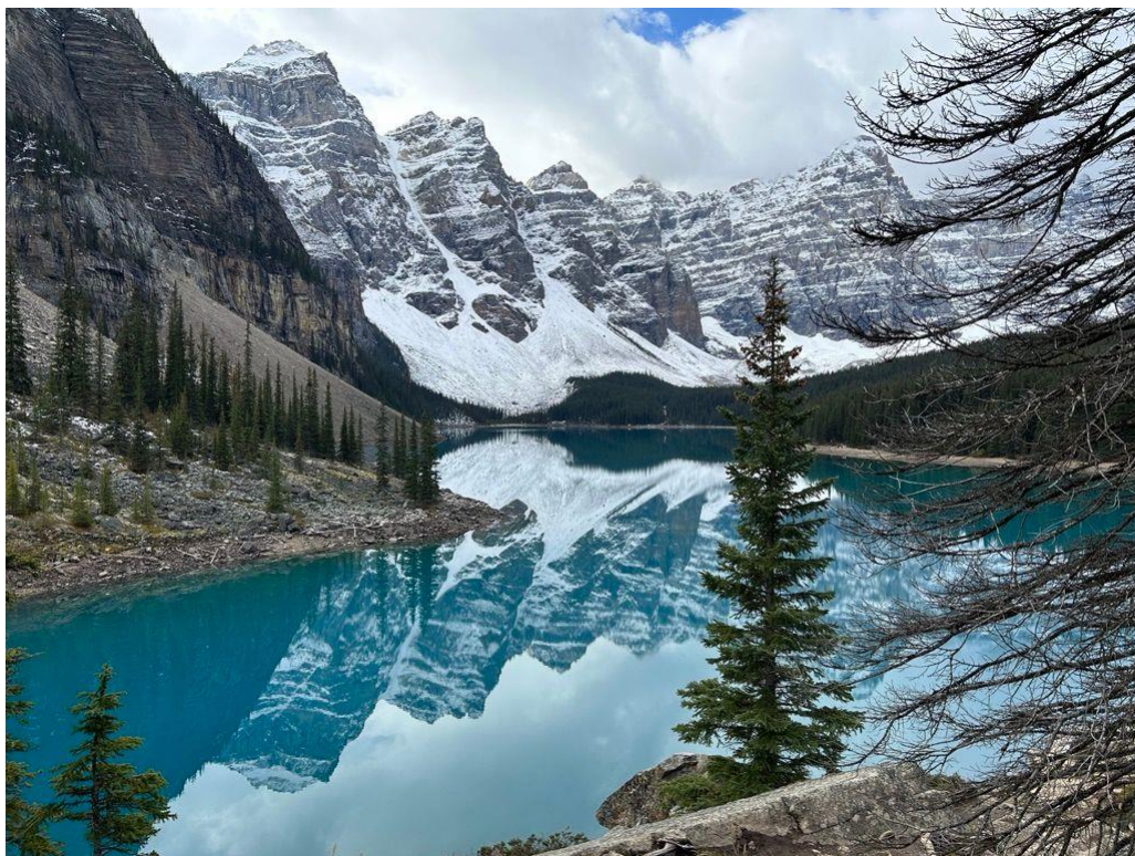
Moraine Lake, near Lake Louise (I thought it was even prettier than the latter).