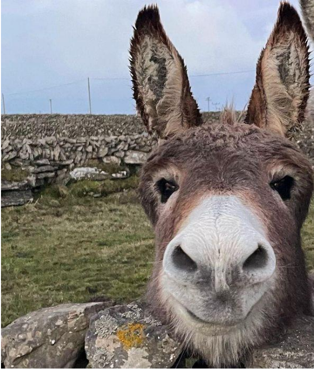
Smile and the world smiles back