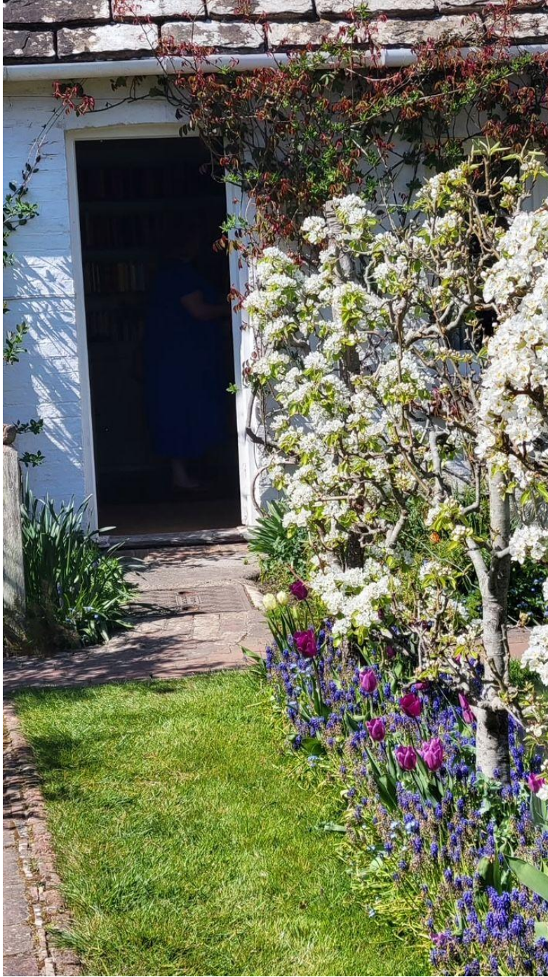
The Monk's House in Lewes which was the home of Virginia Woolf.