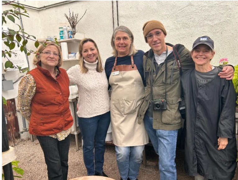
Here is the photo that appeared in the paper: