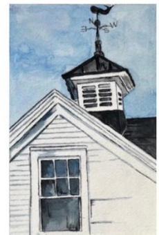
A GARDEN CLUB of BUZZARDS BAY FLOWER SHOW MAY 13, 2026